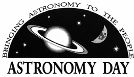
Astronomy Day Name Tag